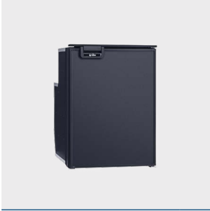
DC50X 50L 12V / 24V