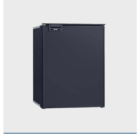
DC85X 85L 12V / 24V