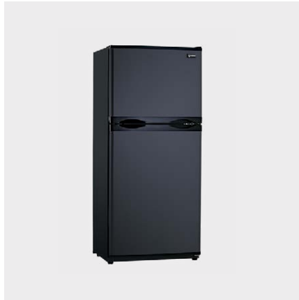
DC190L 190L 12V / 24V