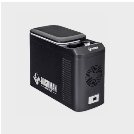
Roadie 15L 12V / 24V FRIDGE / FREEZER