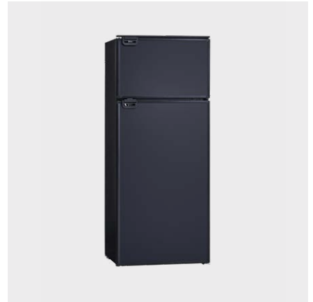
DC230X 230L 12V / 24V