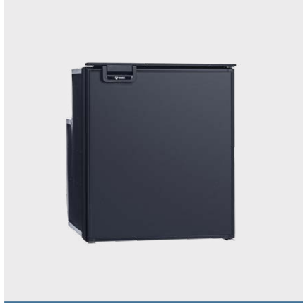
DC65X 65L 12V / 24V