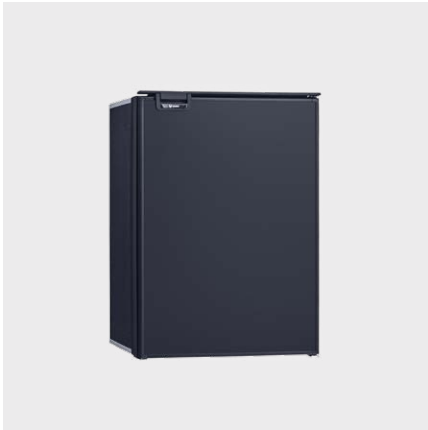
DC130X 130L 12V / 24V