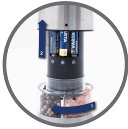
REQUIRES 6 x AAA BATTERIES PER GRINDER (NOT INCLUDED)